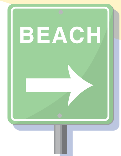
Living in a sunny area