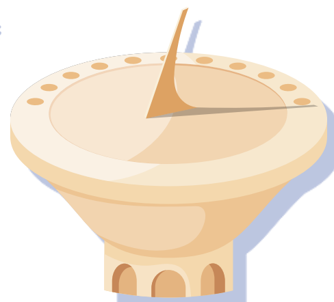
Time in the sun